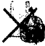
No Plastic Bags